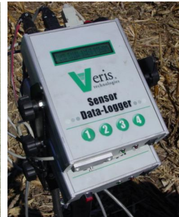
Veris EC systems feature user-friendly electronics, require no calibration, and have no electrical interference issues.