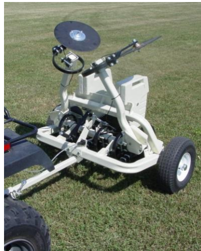
Wings fold for loading on trailers and for storage.